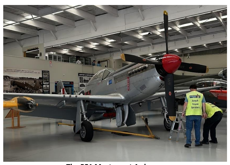
The P51 Mustang at Ardmore