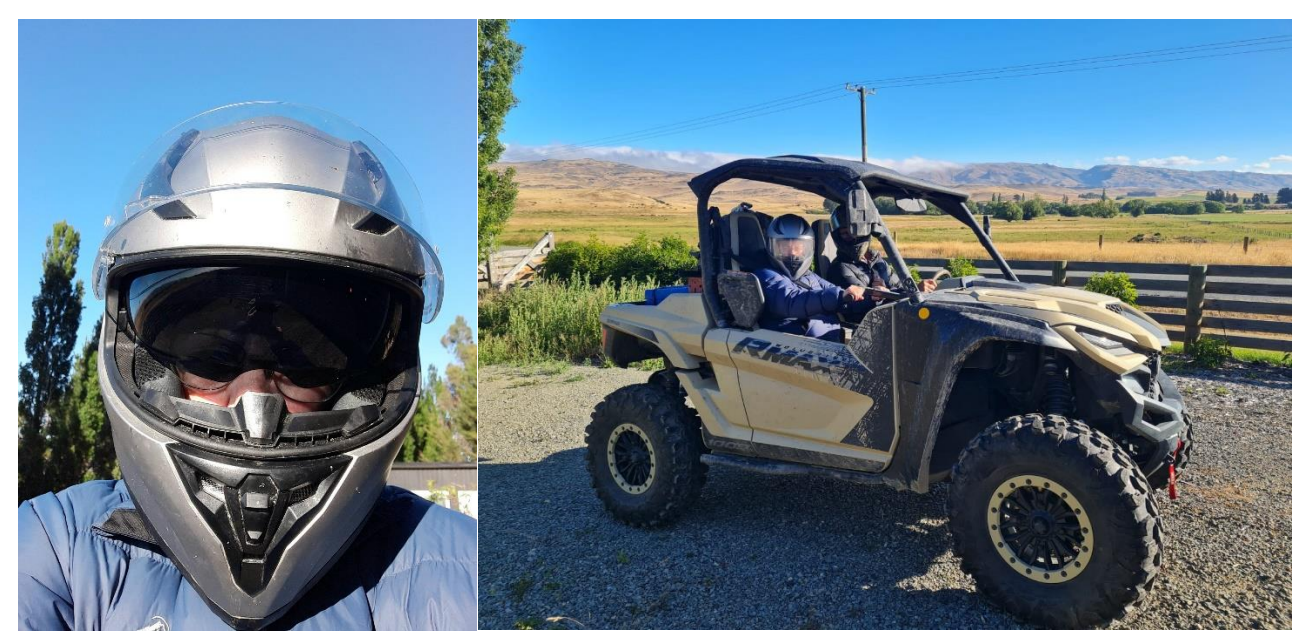
Do you recognise the Editor??

• The Editor of Table Talk enjoyed a blat in an ATV (all-terrain vehicle) along a dry riverbed in Central Otago