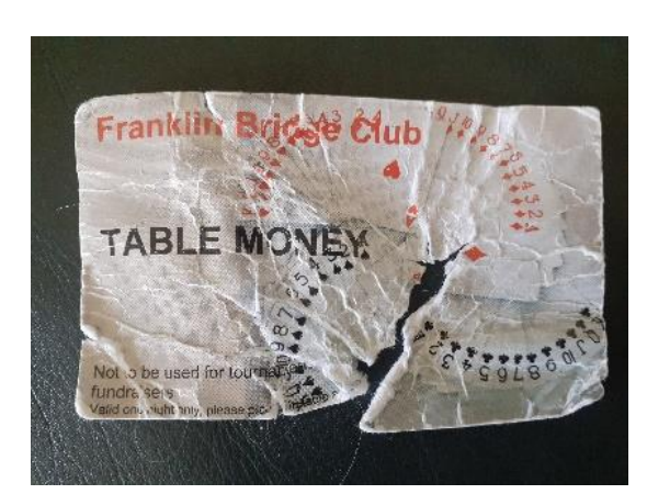
A well-used Table Money Card now removed from circulation

Table money vouchers can be purchased in blocks of 5 for $30, or 10 for $60. They are available from Treasurer Teresa Green or from Maureen Nelson. If you are paying online, please pay FIRST so that vouchers can just be handed over to you. Cash is also accepted on the night BUT correct change is much appreciated. See below... a retired table money card.